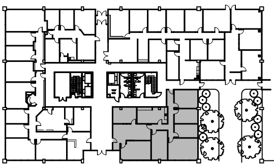
1st FLOOR KEY PLAN